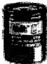
Typical AC / Delco oil filter

Please contact your General Motors Remarketing Representative with any questions.